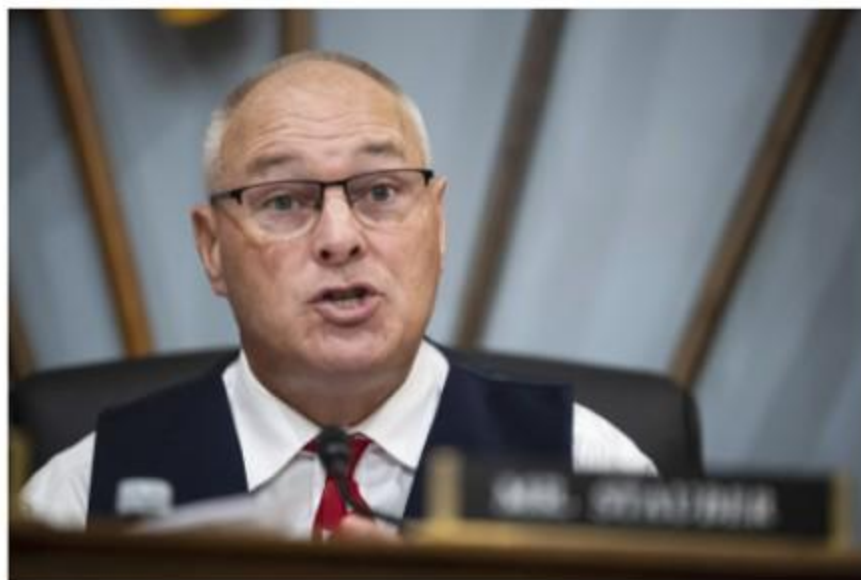
Rep. Pete Stauber (R-Minn.), chair of the Natural Resources Subcommittee on Energy and Mineral Resources, will hold a hearing this week on legislation to modify executive orders on mining.