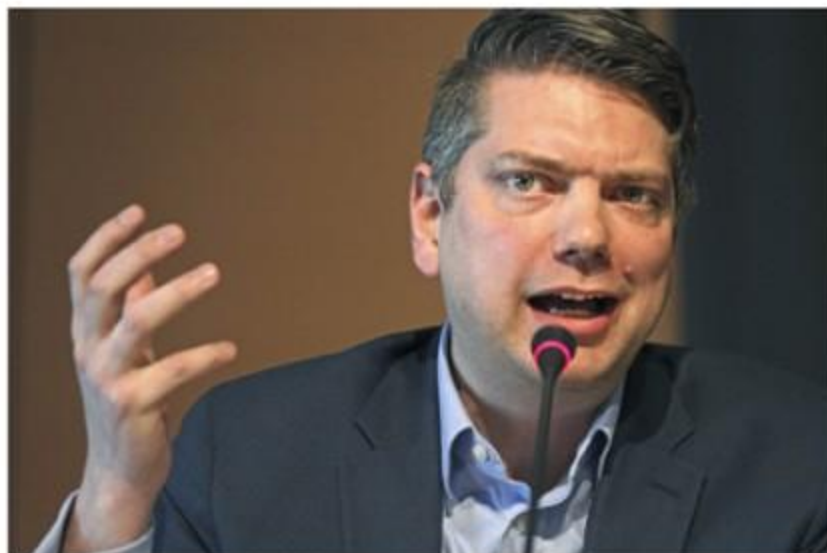
Rep. Nick Begich (R-Alaska) is sponsoring a resolution against a Biden-era resource management plan affecting his state.