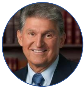
Sen. Manchin (D-WV)