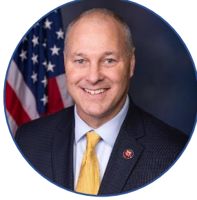
Rep. Stauber (R-MN)