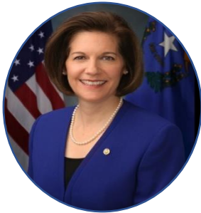
Sen. Cortez Masto (D-NV)