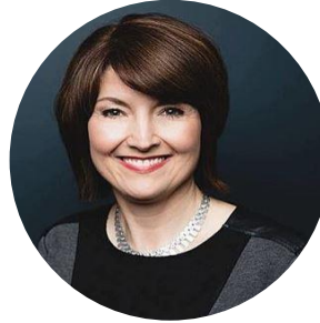
Rep. McMorris Rodgers (R-WA)