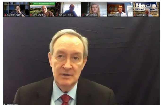
Screenshots from NMA hosted virtual fundraisers for Sen. Crapo (R-ID) and Rep. Westerman (R-AR)