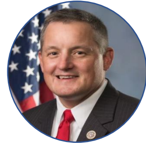
Rep. Westerman (R-AR)