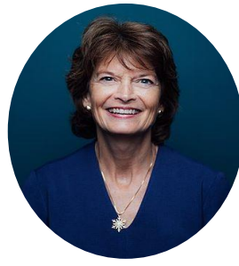
Sen. Murkowski (R-AK)