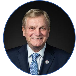
Rep. Simpson (R-ID)